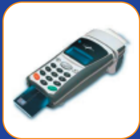
Wireless Chip & Pin