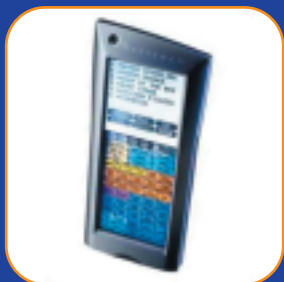
Wireless Order Taking with Orderman