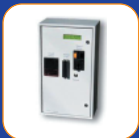
Cashless Catering Option