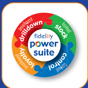
Links to Powersuite Back Office